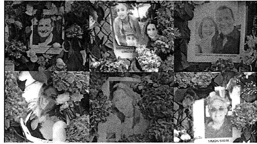
A memorial for the missing and deceased in Surfside, Fla.