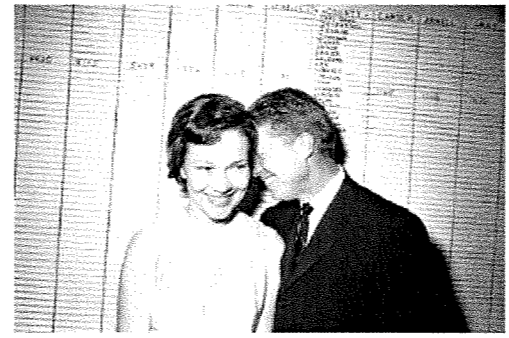
Then Georgia State Sen. Jimmy Carter hugs his wife, Rosalynn, at his Atlanta campaign headquarters in 1976.