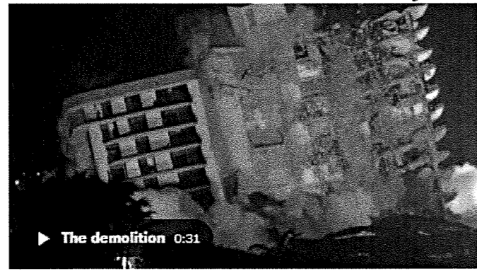
The demolition 0:31